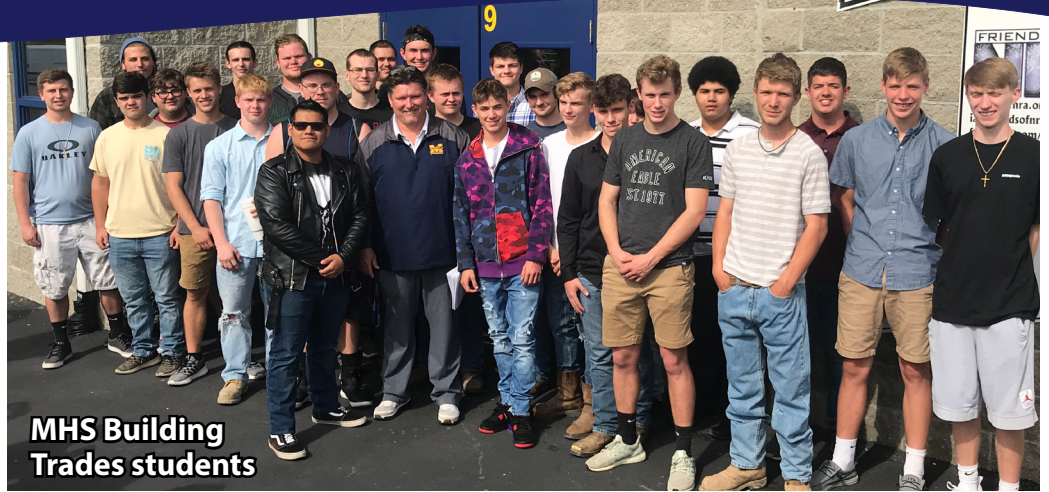
MHS Building Trades students