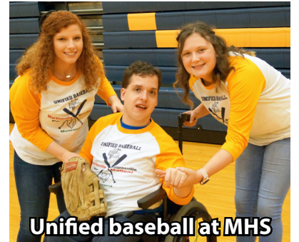
Unified baseball at MHS