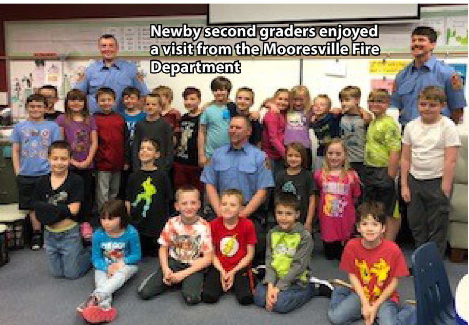
Newby second graders enjoyed a visit from the Mooresville Fire Department