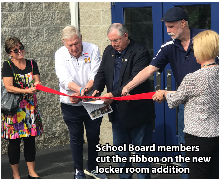
School Board members cut the ribbon on the new locker room addition