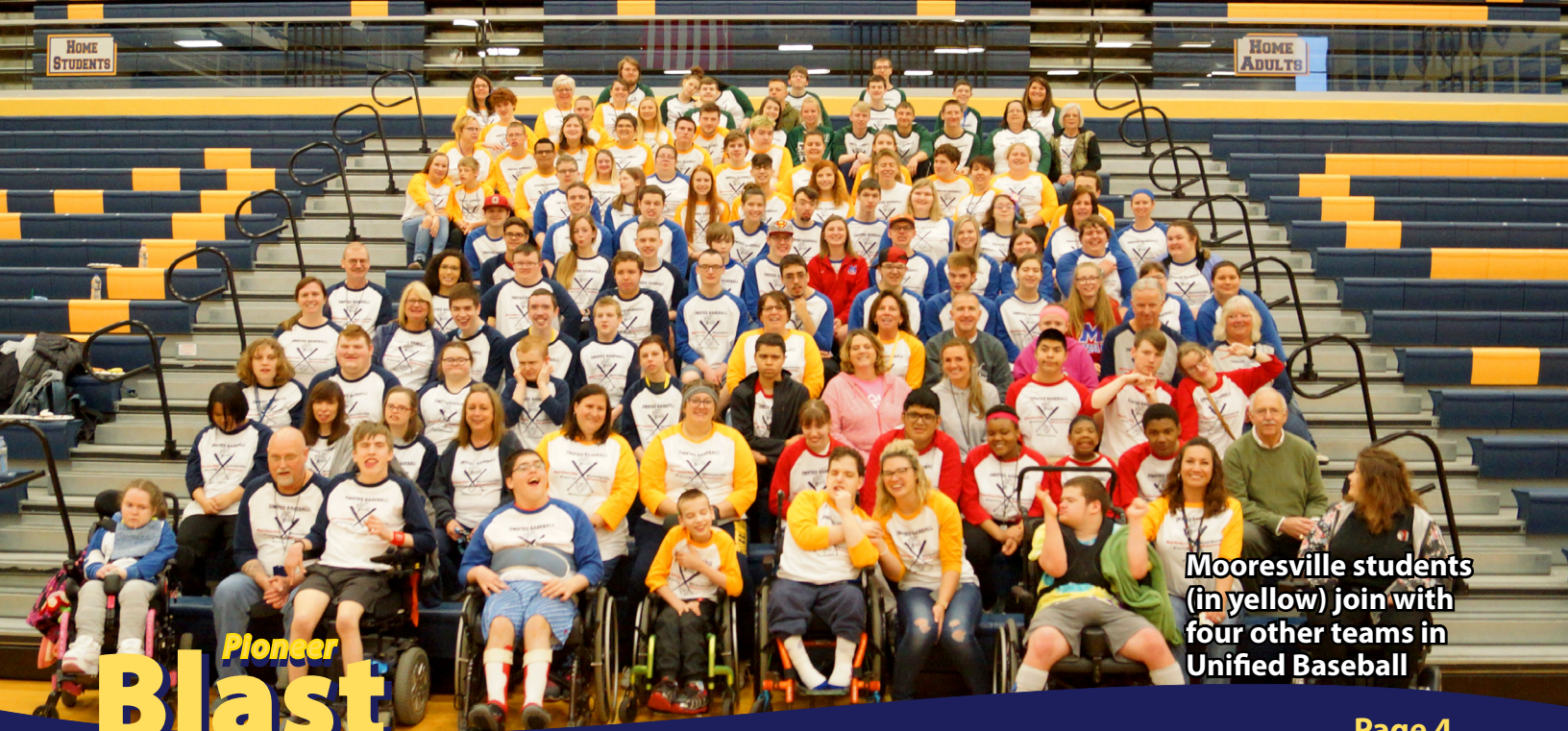
Mooreville students (in yellow) join with four other teams in Unified Baseball